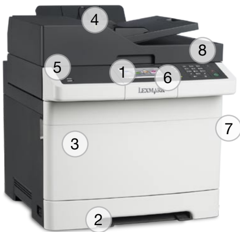
XC2130 with 10.9 cm (4.3-inch) colour touch screen