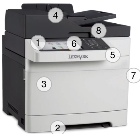
XC2132 with 17.8 cm (7-inch) colour touch screen